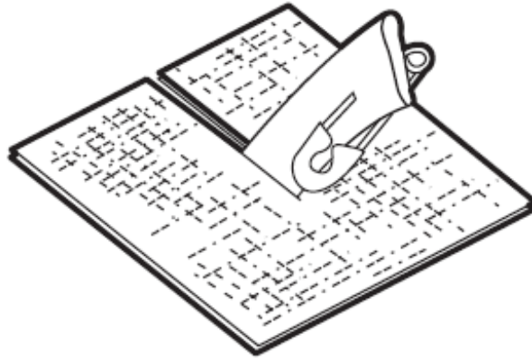
Figure 1. Penrose drain

How long you have your drain depends on your surgery and how much fluid is draining from your incision. As your incision heals, you'll have less fluid. When no fluid drains from your Penrose drain for 24 hours, contact your doctor to make an appointment to remove it.