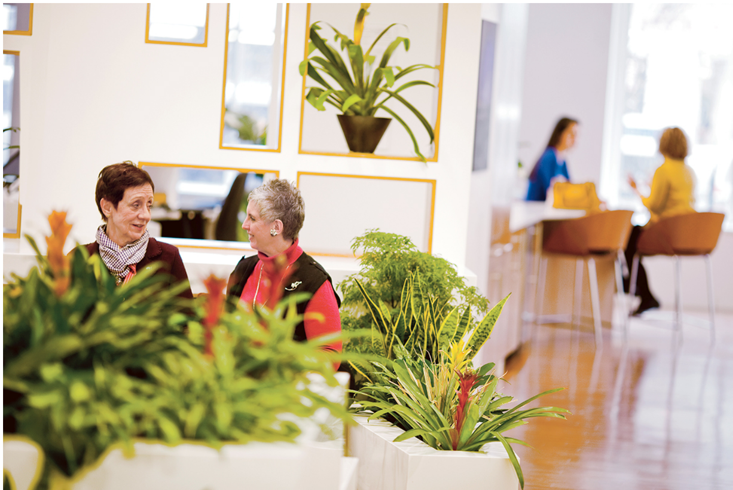
The indoor garden is a hallmark of the Brooklyn Infusion Center.