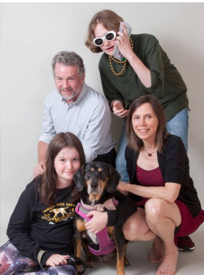
'You're Going to Get Through This.' An MSK Patient Reflects on Her Treatment for Pancreatic Cancer