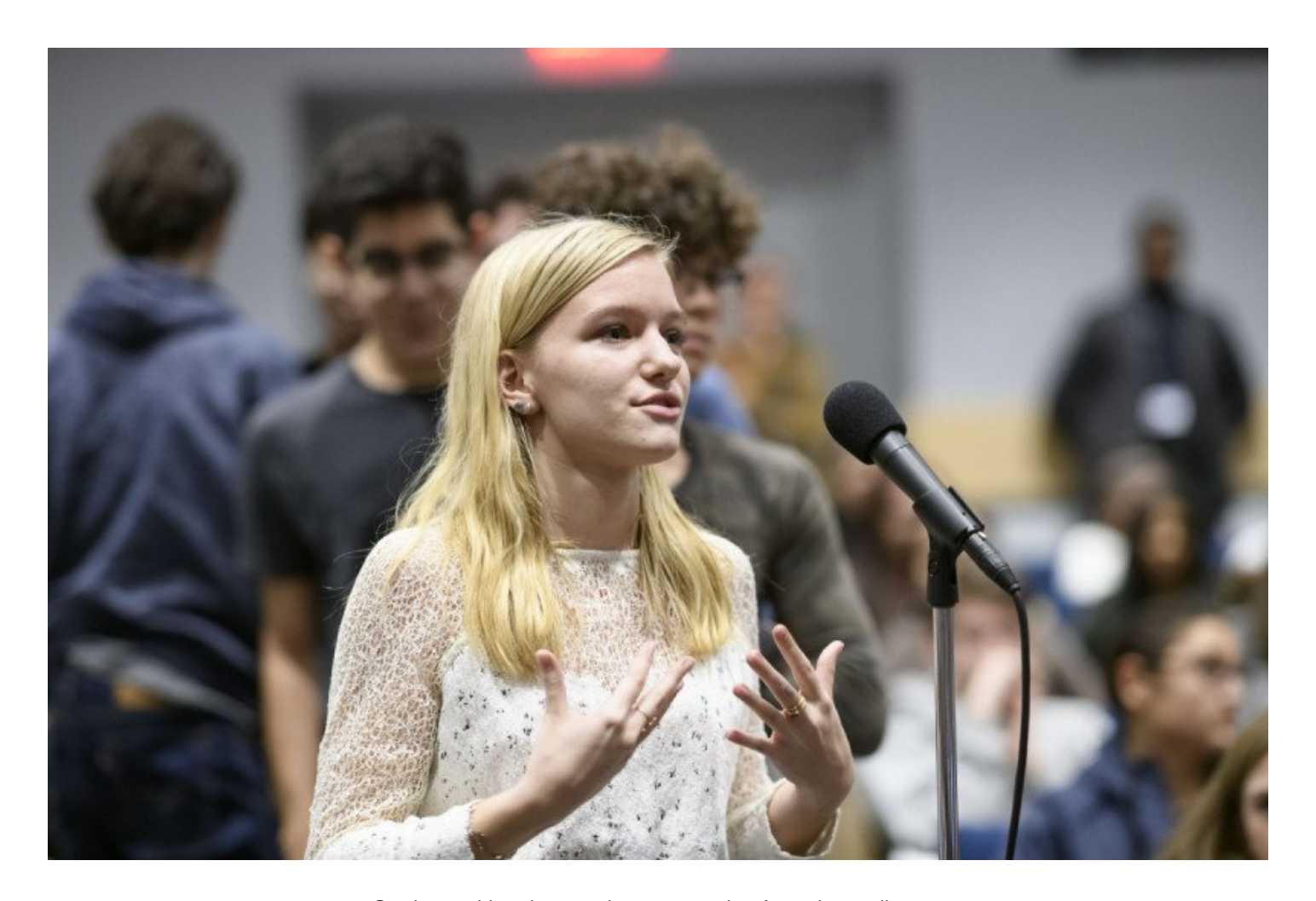
Student asking the speakers a question from the audience.