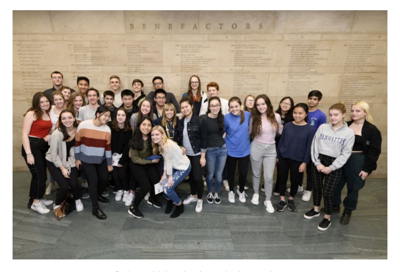
Students and their teacher after meeting the researchers.