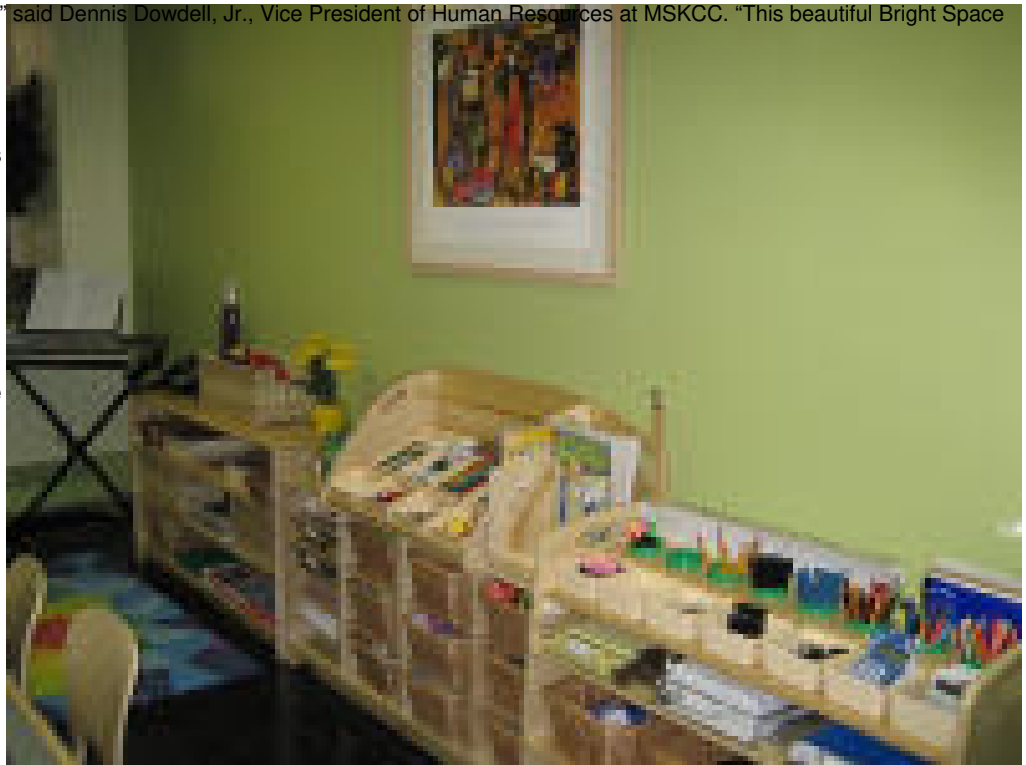
Craft materials, school supplies, and educational games and toys are readily available to spur creativity and learning