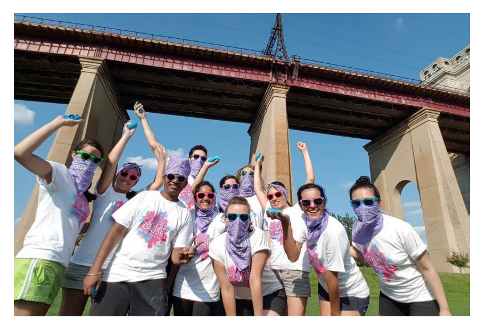
Postdocs participating in a Color Wars fund raiser for MSK.