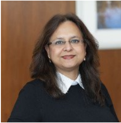
The Amita Shukla-Dave Lab