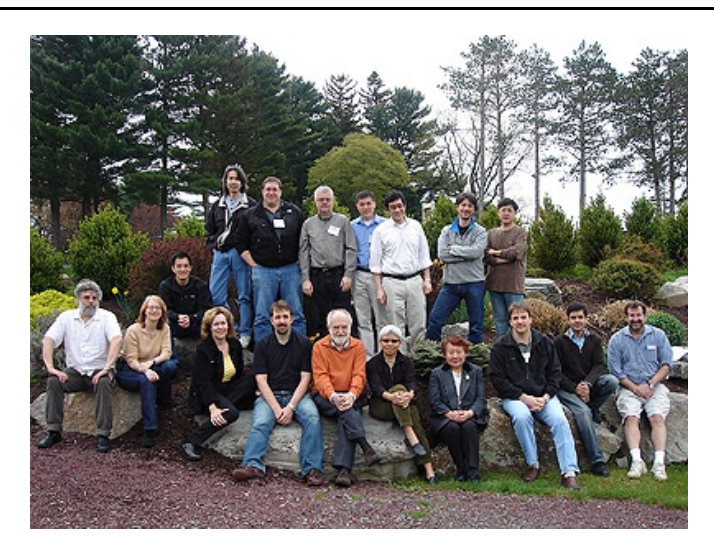
The Pharmacology Faculty also got to enjoy some outdoor activities at Skytop Lodge, including archery and trap shooting!