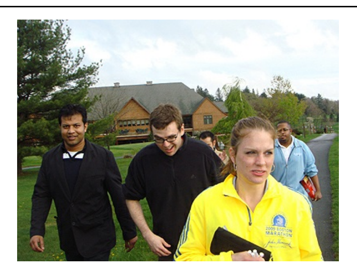
The Tan group braves the rain and heads out to the links!