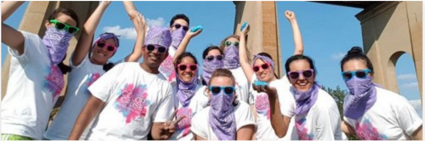
Life as a Postdoc