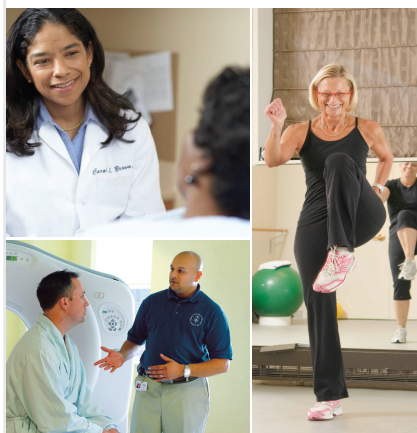
2014 Community Service Plan Update on Activities to Benefit the Community