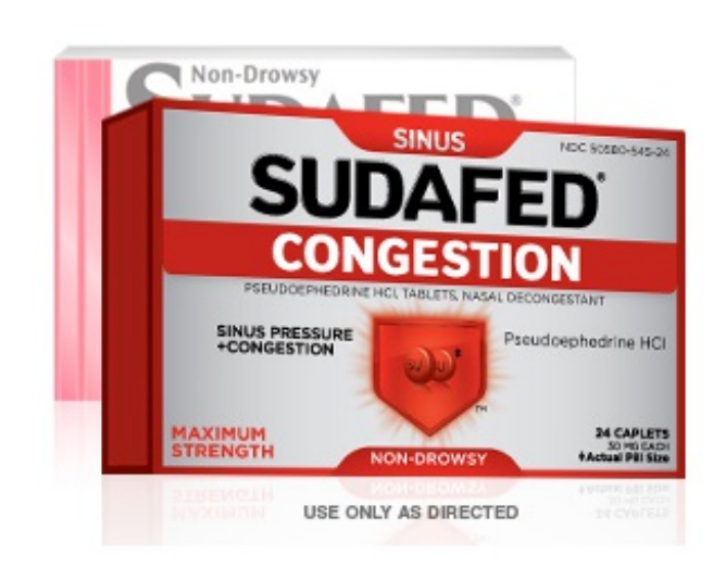
Figure 4. Pseudoephedrine HCl

Make sure to have pseudoephedrine HCl with you as long as you're using the penile injections.