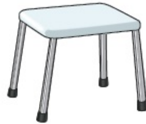
Figure 4. Shower chair without back or arm