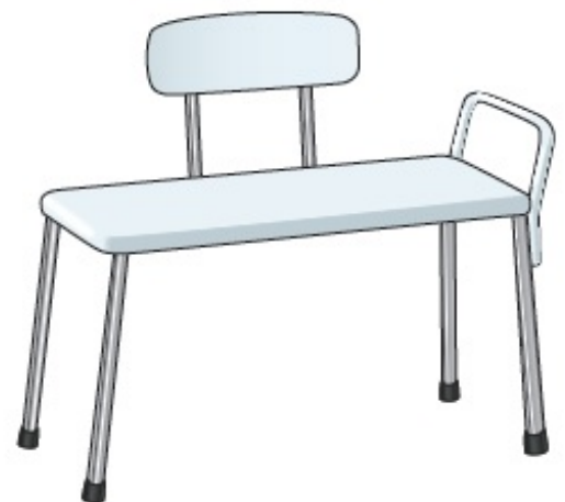
Figure 5. Transfer tub bench

A transfer tub bench is a seat used to help you move in and out of your shower or bathtub. It's helpful for people who may have trouble lifting their legs to step over the tub. The bench has rubber caps or suction cups at the bottom of each leg (see Figure 5). They keep the bench from moving in the tub to help you move safely and easily.