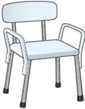
Figure 2. Shower chair with arms and back