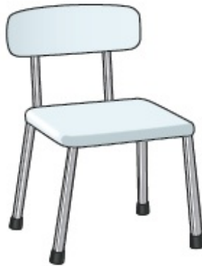
Figure 3. Shower chair with back