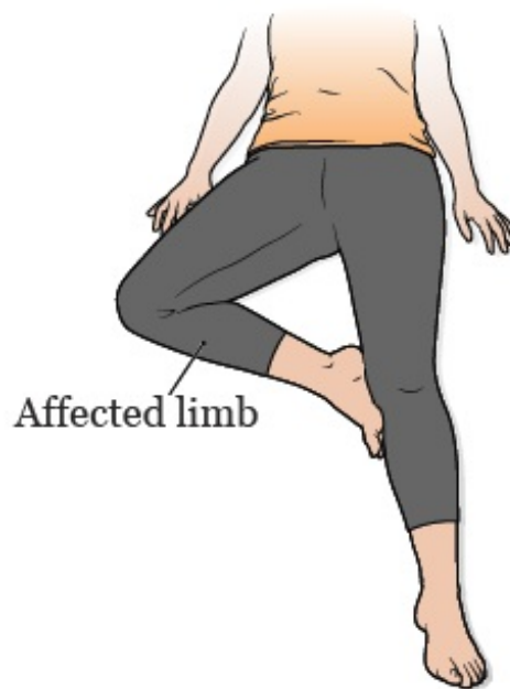
Figure 1. The frogleg position