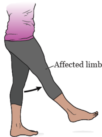
Figure 2. Flexing your hip