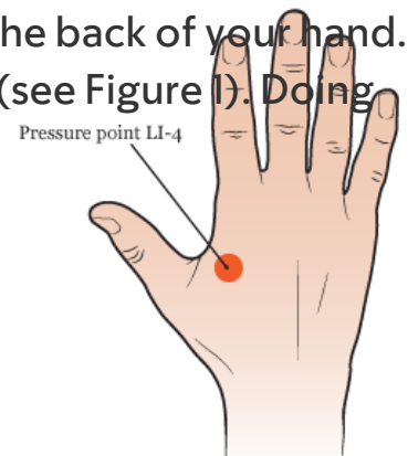
Figure 1. Pressure point LI-4 on back of hand