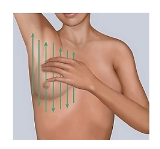
Figure 5. Using the vertical pattern to examine your breast

If you notice any changes in your breasts, call your doctor.