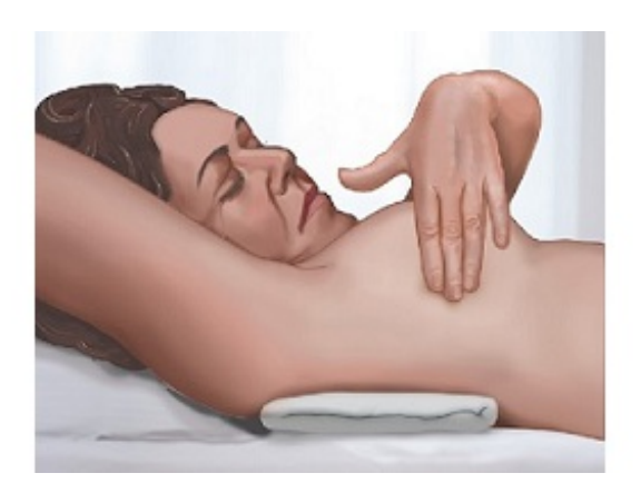
Figure 4. Breast self-exam while lying down