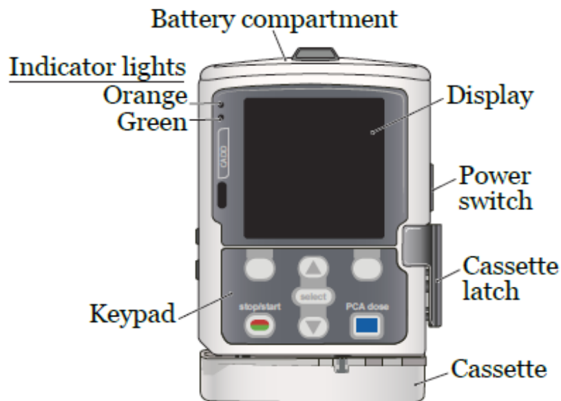
Figure 1. CADD-Solis VIP Pump

Your CADD-Solis VIP pump is a small, battery-operated pump. It's used to send fluids, medication, and chemotherapy through your veins (see Figure 1).