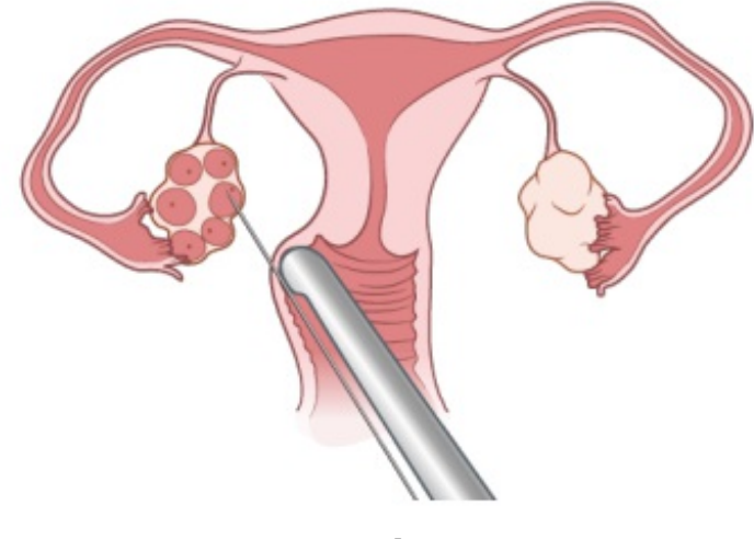
Figure 3. Egg retrieval

Once the eggs are retrieved, they will be frozen for your future use. The eggs can be frozen unfertilized or after they are fertilized with sperm to create embryos (in- vitro fertilization). Eggs and embryos can be stored for as long as you want.