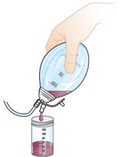
Figure 2. Emptying the bulb