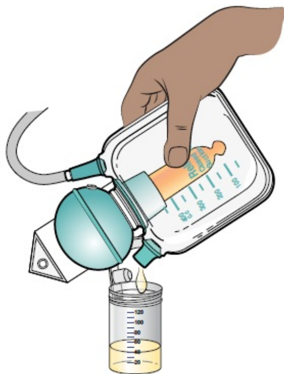
Figure 3. Emptying the ReliaVac drain