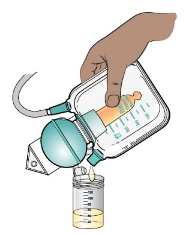
Figure 3. Emptying the