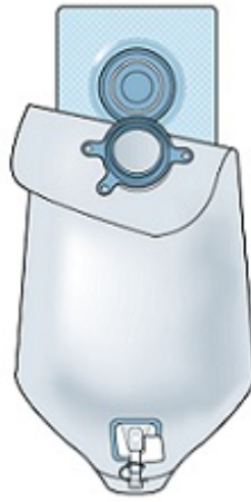
Figure 2. Attaching the pouch to the wafer in a 2-piece system