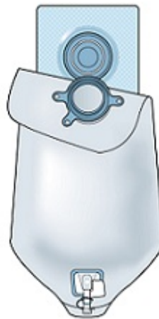
Figure 2. Attaching the pouch to the wafer