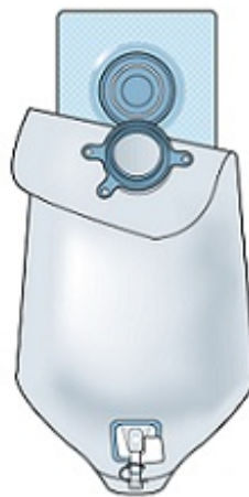
Figure 2. Attaching the pouch to the wafer