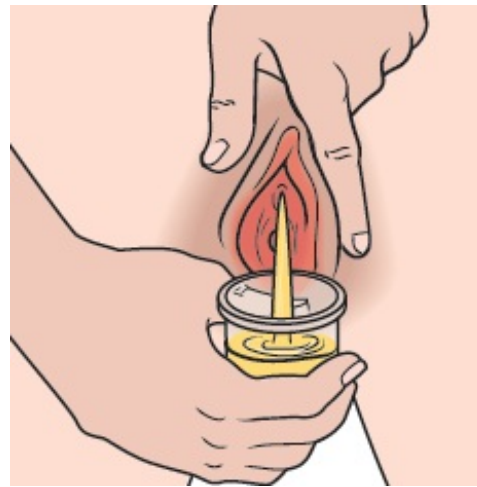
Figure 3. Urinating into the urine cup