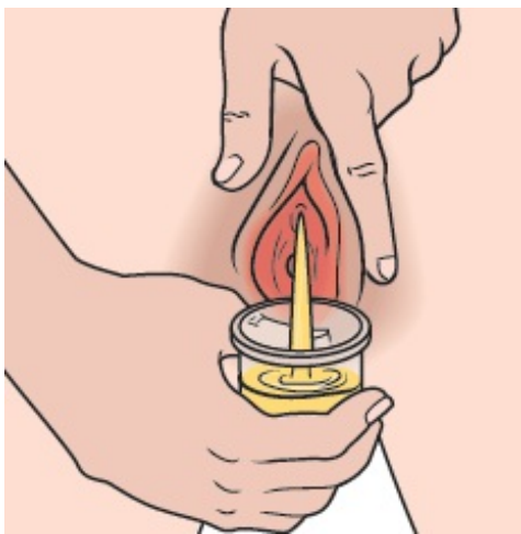
Figure 3. Urinating into the urine cup