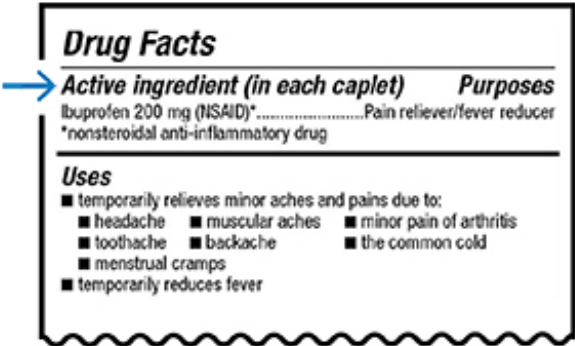
Figure 1. Active ingredients on an over-the-counter medicine label

Over-the-counter medicines list their active ingredients in the “Drug Facts” label (see Figure 1). Active ingredients are always the first thing on the Drug Facts label.