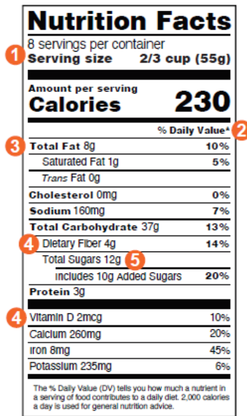
Figure 3. How to read a food label

Less sugar is better. Save foods or beverages with more than 15 grams of sugar per serving for special occasions. Choose foods with less added sugar.