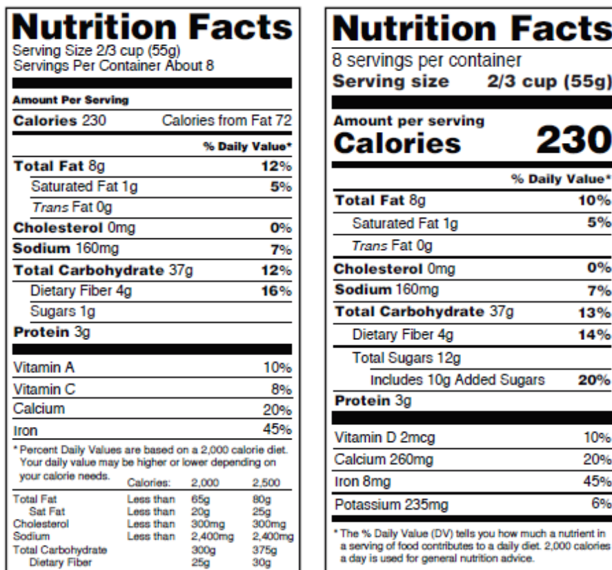
Figure 2. Old food label (left) and new food label (right)

Here is an example of the current food label and the new food label.