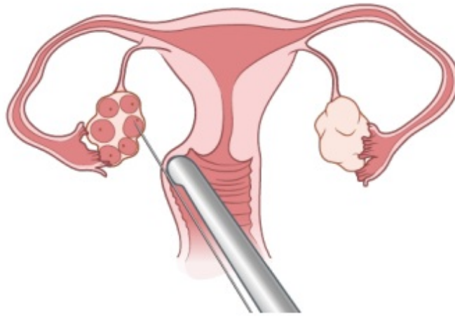
Figure 3. Egg retrieval