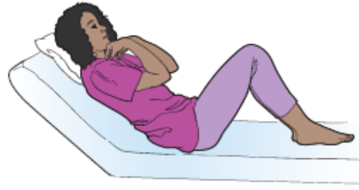
Figure 9. Touching your shoulders