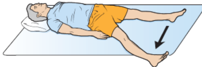
Figure 5. Abductor strengthening