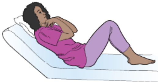
Figure 9. Touching your shoulders