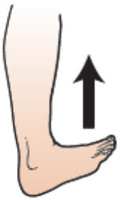
Figure 13. Pointing your toes up