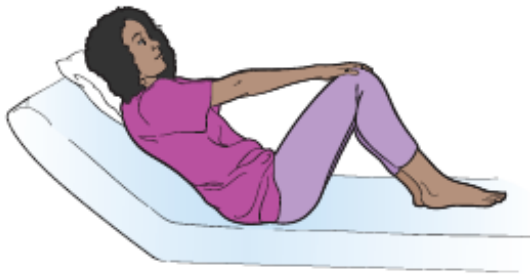
Figure 8. Reaching your arms out