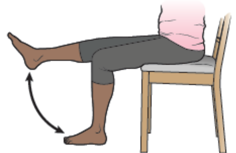
Figure 16. Kicking your foot up