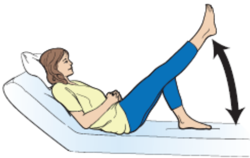
Figure 7. Lifting your leg