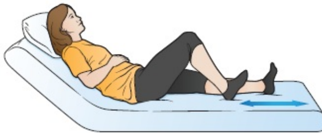
Figure 1. Heel slides