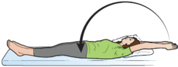
Figure 11. Overhead stretch