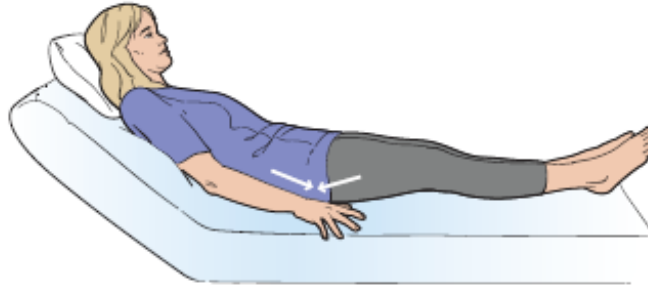
Figure 4. Gluteal sets