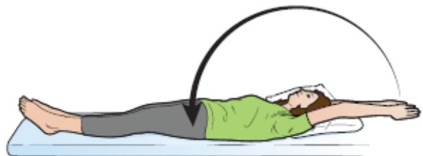
Figure 11. Overhead stretch