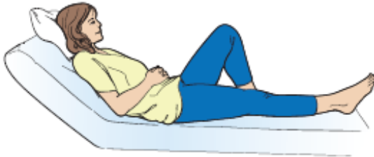
Figure 6. Bending your leg