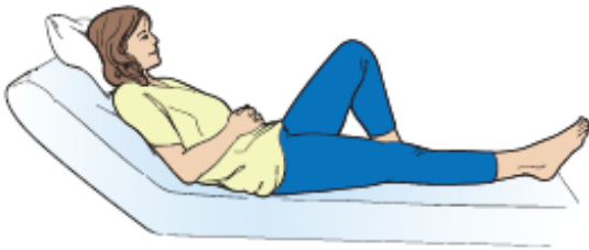
Figure 6. Bending your leg