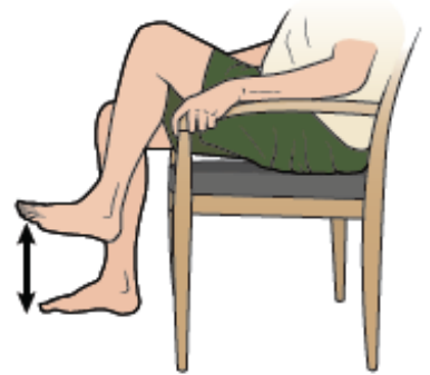
Figure 15. Marching in place