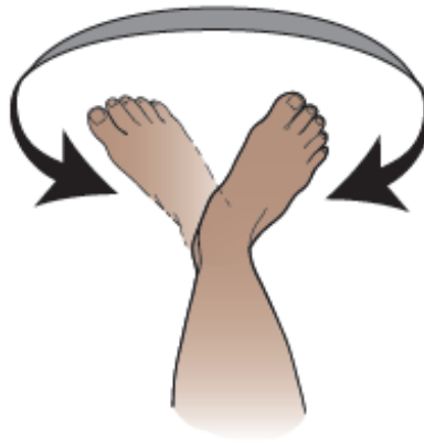
Figure 12. Ankle circles