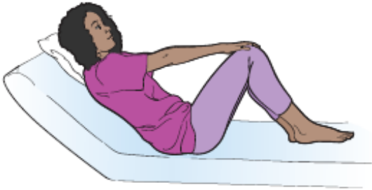
Figure 8. Reaching your arms out