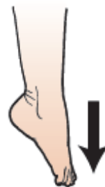
Figure 14. Pointing your toes down