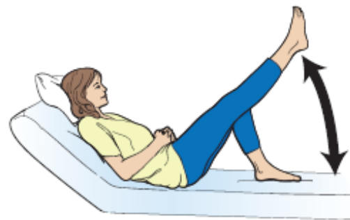
Figure 7. Lifting your leg