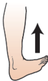
Figure 13. Pointing your toes up