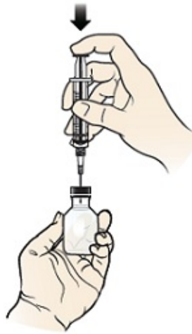
Figure 3. Inject the liquid into the glucagon vial