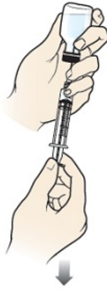
Figure 5. Drawing the glucagon into the syringe