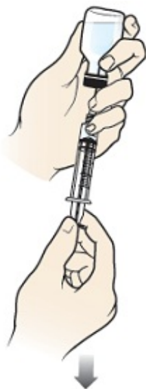
Figure 5. Fill the syringe with glucagon mixture

Pull back on the plunger of the syringe to fill the syringe with all the medication in the vial. If there is air at the top of the syringe, gently push the plunger to remove it.