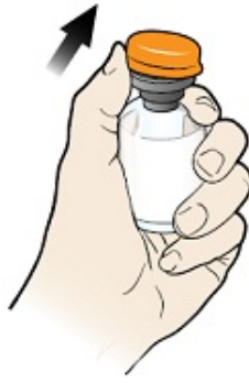
Figure 2. Take off the plastic cap