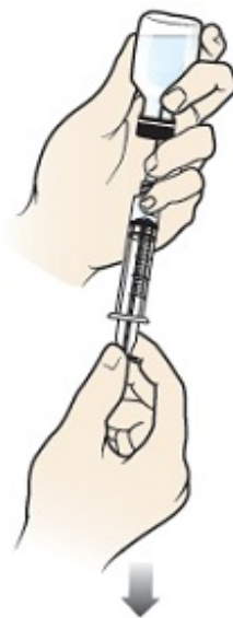
Figure 5. Fill the syringe with the medicine