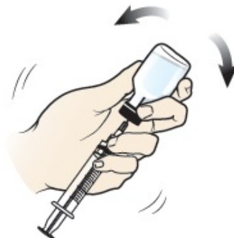
Figure 4. Mix the powder and liquid