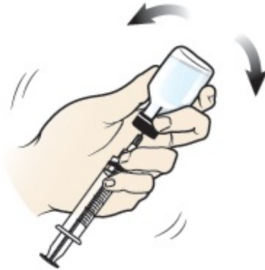
Figure 4. Mix the powder and liquid

The solution should be clear and colorless. You may see bubbles from mixing. This is normal. Do not use the medicine if it's cloudy or you see solid pieces that do not go away after mixing. Call 911 right away.