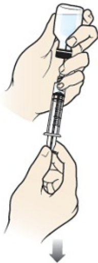
Figure 5. Fill the syringe with the medicine