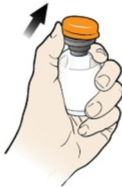
Figure 2. Opening the glass vial with the glucagon powder