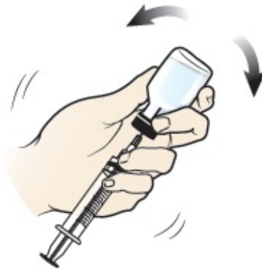
Figure 4. Mixing the glucagon powder with the diluting fluid