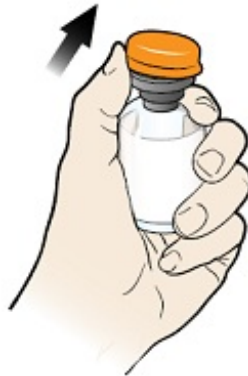
Figure 2. Take off the plastic cap