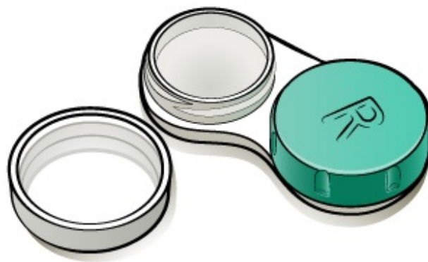
Figure 1. Contact lens case for multipurpose contact solution