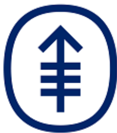
Figure 1. The new app icon