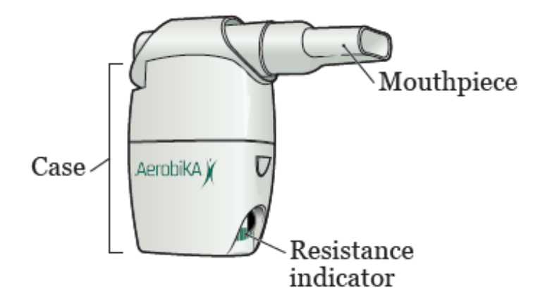
Figure 1. Parts of your Aerobika

Don't let anyone else use your Aerobika. Replace it after 12 months or right away if it breaks.