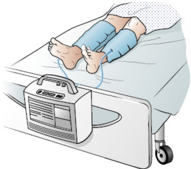
Figure 3. SCD sleeves on your legs

If you're in the hospital, your risk of getting a blood clot is higher. To help prevent a blood clot, you can use SCD sleeves.