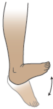
Figure 2. Ankle pumps