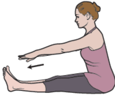
Figure 8. Leg stretch