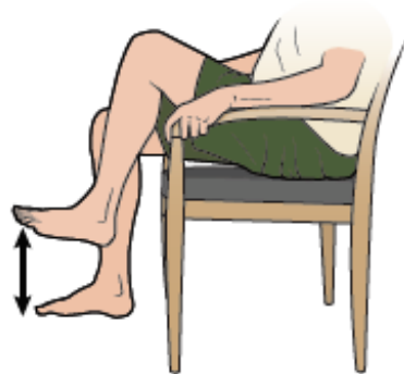
Figure 3. Marching in place