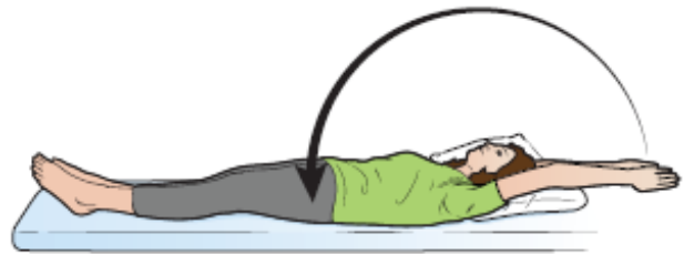
Figure 7. Arms over your head