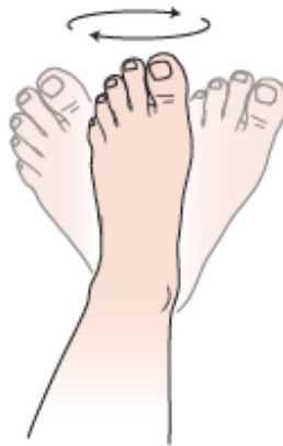
Figure 1. Ankle circles