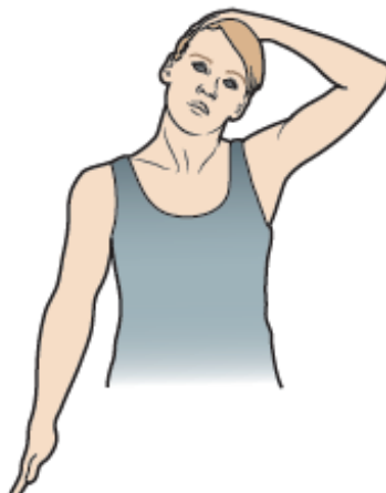
Figure 9. Side neck stretch