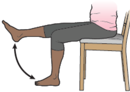
Figure 4. Sitting kicks