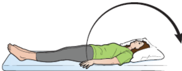
Figure 6. Arms at your side