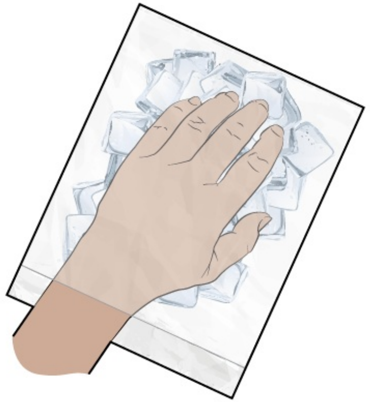
Figure 2. During nail cooling

Some people stop the cooling because of these side effects.