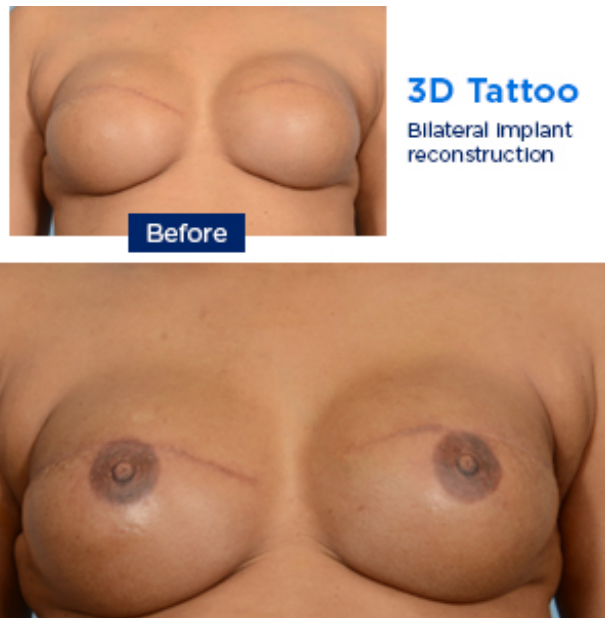
3D tattoo: Bilateral implant reconstruction

This page has graphic medical photos of breasts with nipple and areola tattoos. They are before and after photos of patients who had the procedure. MSK physician assistants are trained in making tattoos of nipples and areolas for people who had them removed during breast cancer surgery.