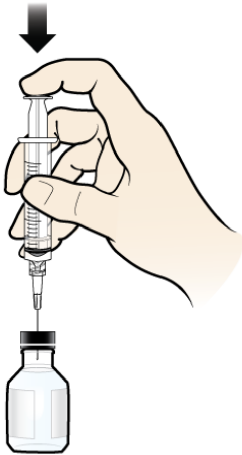
Figure 1. Injecting air into the vial

the needle will bend. Make sure the tip of the needle is in the medication. Rotate the syringe so you're looking at the numbers and lines on the syringe.