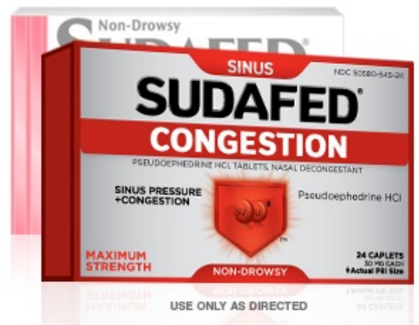
Figure 4. Pseudoephedrine HCl

Make sure to have pseudoephedrine HCl with you as long as you're using the penile injections.