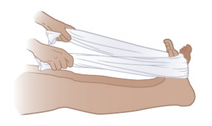
Figure 4. Foot stretches