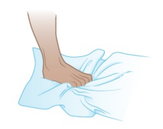
Figure 3. Toe curls using a towel