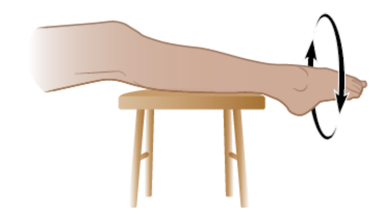
Figure 5. Ankle circles

4. Repeat this exercise with your left ankle.