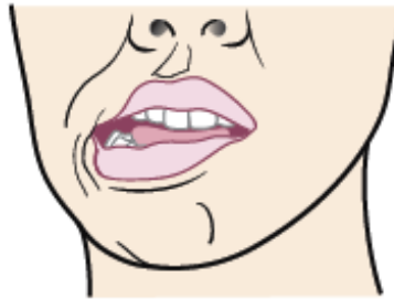
Figure 4. Move your jaw to the right