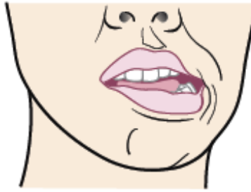
Figure 3. Move your jaw to the left