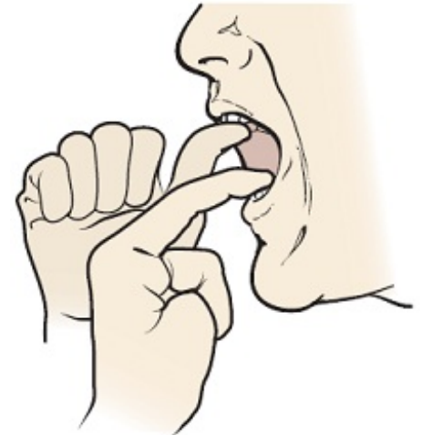
Figure 5. Use your fingers to give extra resistance

Your swallowing specialist may notice changes in your ability to swallow. If so, they may teach you other exercises or ways to help you keep swallowing during your treatment.