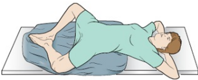
Figure 1. Lying on your back

You will be lying on your stomach or back during your simulation and each treatment (see Figures 1 and 2). To help you stay in the correct position, a mold may be made of the part of your body that needs to remain still. Your radiation therapists will make this for you.