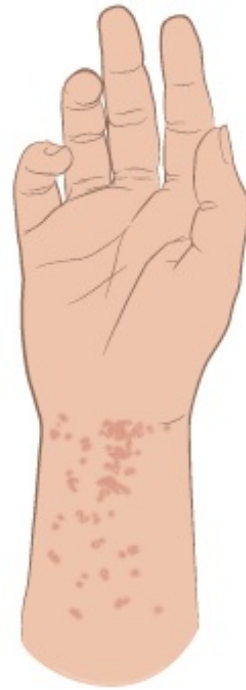
Figure 1. Scabies rash and burrows