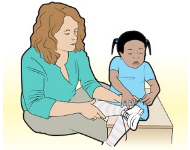
Figure 1. Working with an OT