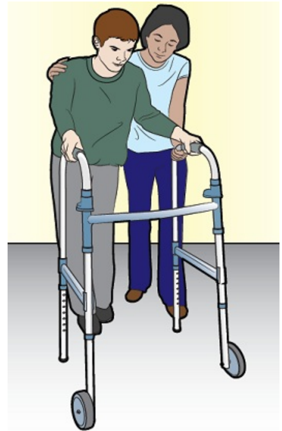
Figure 2. Working with a PT