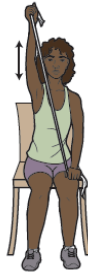
Figure 7. Pull band over head