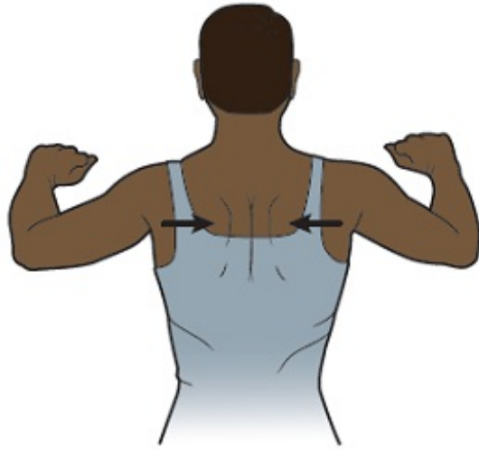
Figure 8. Squeeze shoulders together