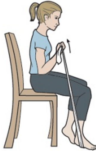
Figure 3. Pull band up