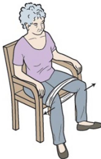
Figure 7. Seated abductor strengthening with elastic band