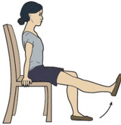
Figure 9. Sitting kicks

If you have questions or concerns, contact your healthcare provider. A member of your care team will answer Monday through Friday from 9 a.m. to 5 p.m. Outside those hours, you can leave a message or talk with another MSK provider. There is always a doctor or nurse on call. If you're not sure how to reach your healthcare provider, call 212-639-2000.