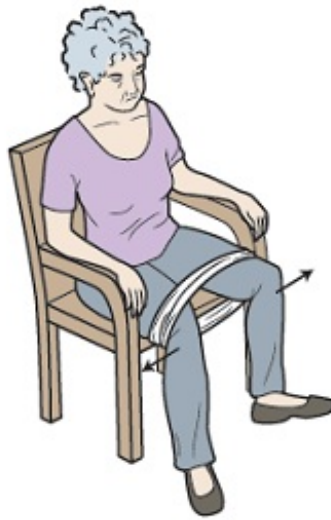
Figure 7. Seated abductor strengthening with elastic band