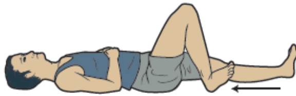
Figure 6. Heel slides