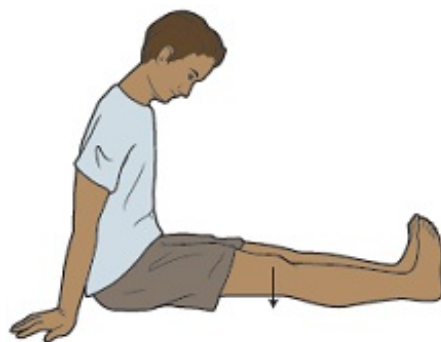
Figure 3. Quadriceps sets