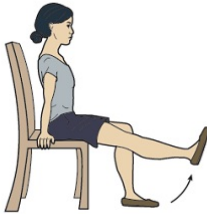
Figure 9. Sitting kicks

If you have any questions, contact a member of your healthcare team directly. If you're a patient at MSK and you need to reach a provider after 5:00 PM, during the weekend, or on a holiday, call 212-639-2000.