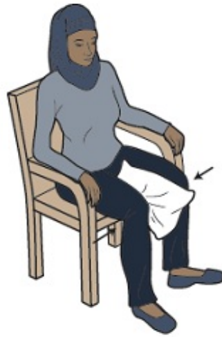
Figure 8. Seated pillow squeezes