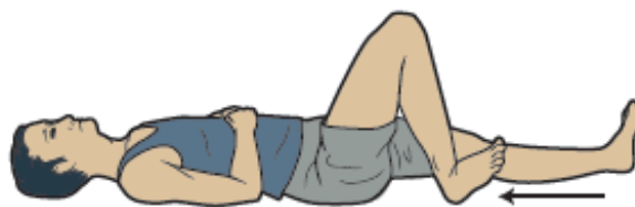
Figure 6. Heel slides