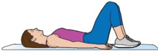
Figure 7. Lie flat with knees bent