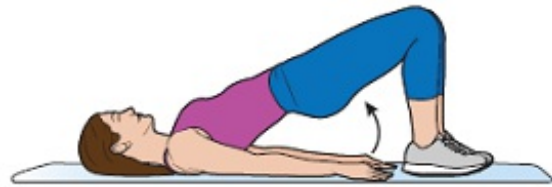
Figure 8. Lift buttocks