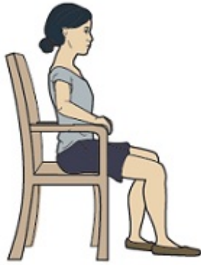
Figure 9. Sit with back straight