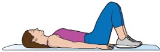
Figure 7. Lie flat with knees bent