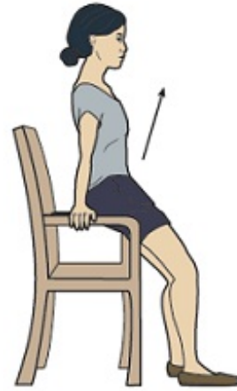
Figure 10. Lift yourself off the chair using the armrests