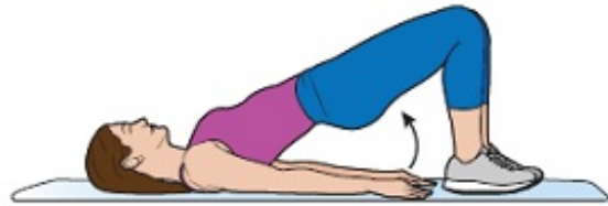
Figure 8. Lift buttocks