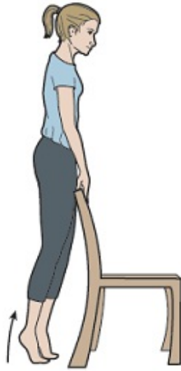
Figure 6. Heel raises