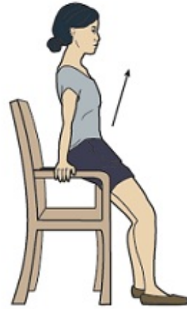
Figure 10. Lift yourself off the chair using the armrests