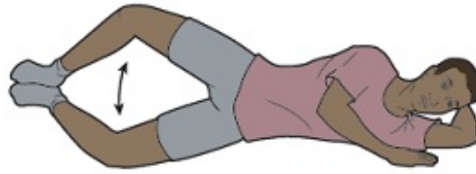
Figure 11. Clamshells

If you have any questions, contact a member of your healthcare team directly. If you're a patient at MSK and you need to reach a provider after 5:00 PM, during the weekend, or on a holiday, call 212-639-2000.