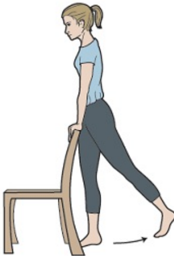
Figure 2. Standing backward kicks