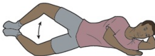
Figure 11. Clamshells