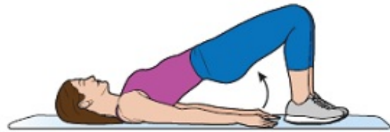
Figure 8. Lift buttocks