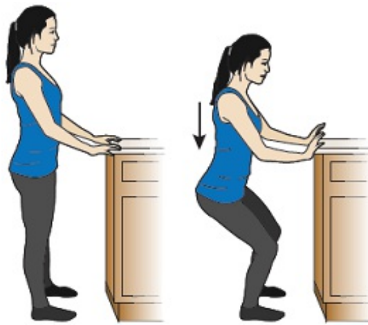
Figure 3. Mini squats