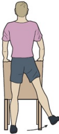
Figure 1. Standing side kicks