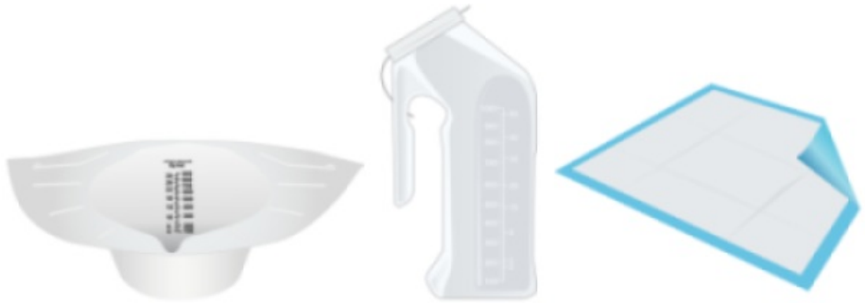
Figure 1. A hat urine container (left), urinal (center), and waterproof pad (right)

You can buy these supplies at your local drug store if you need more.