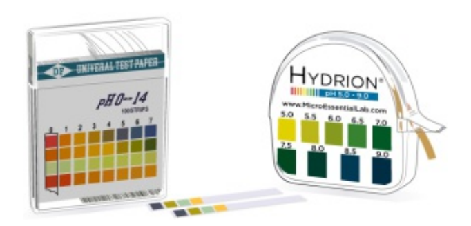
Figure 2. Plastic pH test strips (left) and paper pH test strips (right)