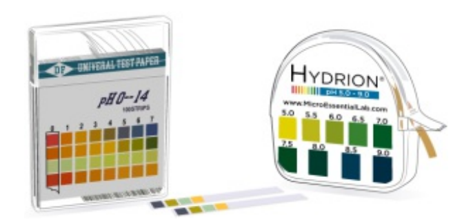
Figure 2. Plastic pH test strips (left) and paper pH test strips (right)